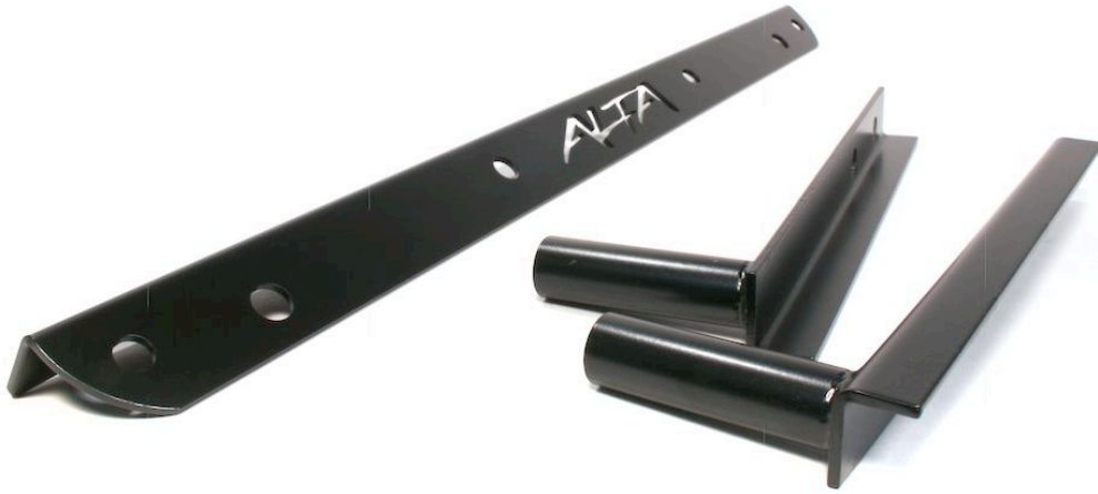
Horizontal Mounting Beam, and Struts shown above