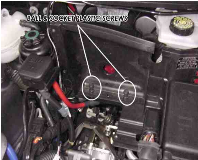
Plastic screws that need to be removed