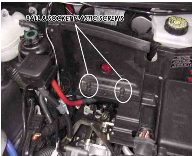
Plastic screws that need to be removed