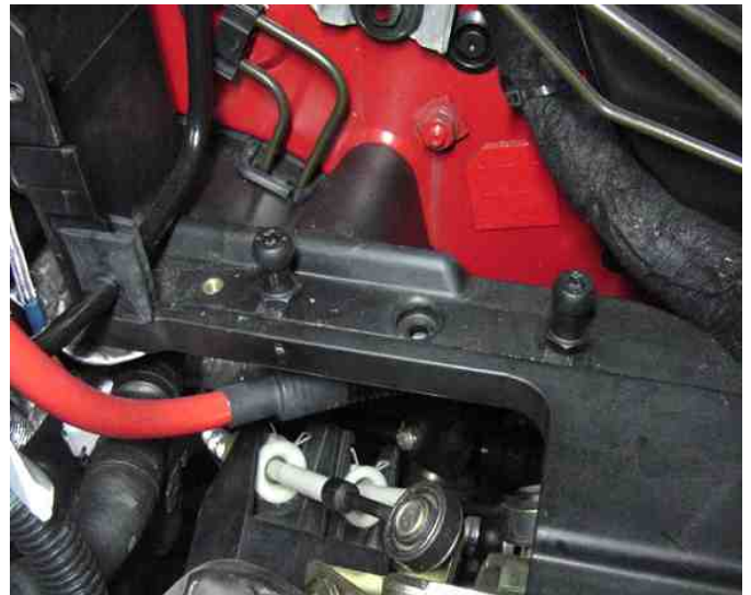
Screws installed after wall removed